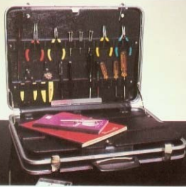
LM4 SIZE: 480 x 360 x 150 COLOUR: BLACK