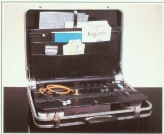
LM3 SIZE: 480 x 360 x 150 COLOUR: BLACK RECOMMENDED: DOCTORS