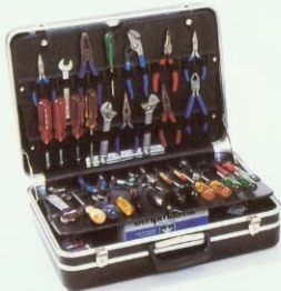
LM1 SIZE: 480 x 360 x 150 COLOUR: BLACK