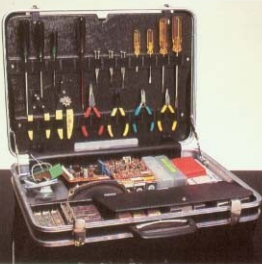
LM2 SIZE: 480 x 360 x 150 COLOUR: BLACK